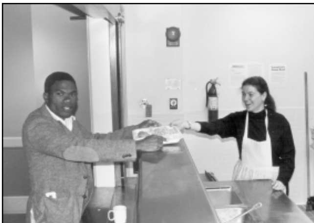
A cheerful Miriam's Kitchen employee doles out a hearty meal to one of the many clients the organization serves.